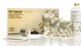
GC Fujivest Platinum

A carbon-free phosphate-bonded investment for precision crown and bridge castings of all dental alloys, including Ni-Cr and Co-Cr.