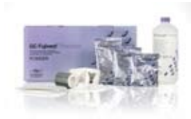
GC Fujivest Premium

The carbon-free phosphate-bonded investment for precision castings of precious, semi-precious and Pd-base alloys, with special attention to complicated implant castings. Fujivest Super can be used in both quick heating and slow heating procedures.