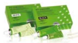
GC Fitchecker I

Exact solutions for the highest demands: Fujivest Platinum, investment material for precious and semi-precious alloys: highly precise castings, offering consistent top quality.