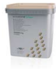
GC Fujirock OptiXscan

White A-silicone material, especially for checking pressure spots and the fit accuracy of crowns, bridges, precast posts, inlays & dentures.