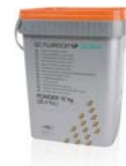
GC Fujirock OptiFlow

With CAD/CAM & implant technologies gaining importance every day, GC has developed a special type 4 stone. Thanks to its specially adapted powder composition Fujirock EP OptiXscan is compatible with all existing scanning devices.