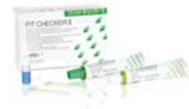
GC Fit Checker II

White and black easy-flowing C-silicone for checking the accuracy of dentures, crowns, bridges, precast posts & inlays.