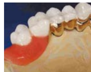
Photographs: ZTM V. Brosch