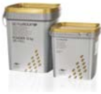
GC Fujirock EP Type 4 Dental Stone

The superior quality Type 4 Dental Die Stone is ideal for all kinds of prosthetics, with high precision, outstanding edge hardness and high-pressure stability. Thus a precise model as a basis for precise prosthetics is achieved.