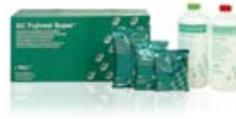
GC Fujivest Super

The superior quality Type 4 Dental Die Stone is ideal for all kinds of prosthetics, with high precision, outstanding edge hardness and high-pressure stability. Thus a precise model as a basis for precise prosthetics is achieved.