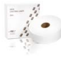
GC Casting Liner

Exact solutions for flexible needs: Fujivest Premium, crown & bridges casting investment, suitable for all types of dental alloys with special attention for non-precious alloys: versatile and robust.